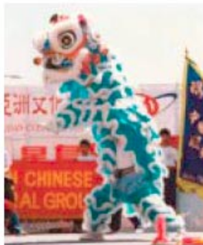
Come early to the Gala and receive the blessings of luck and prosperity from the Lion Dance team of the Marin Chinese Cultural Association.

This year we are working together with the Marin Chinese Cultural Association to create a Gala on October 4 that celebrates the rich cultural heritage of our local Chinese-American community. The main event is the exciting performance of the Shaolin Warriors. The Marin Chinese Cultural Association Lion Dance team will begin the festivities by welcoming everyone as they arrive. So come early and enjoy the pre-show!